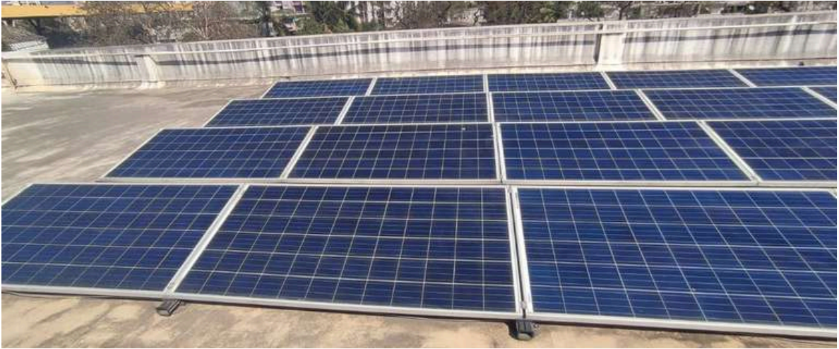
DON BOSCO HIGH SCHOOL (120KW)