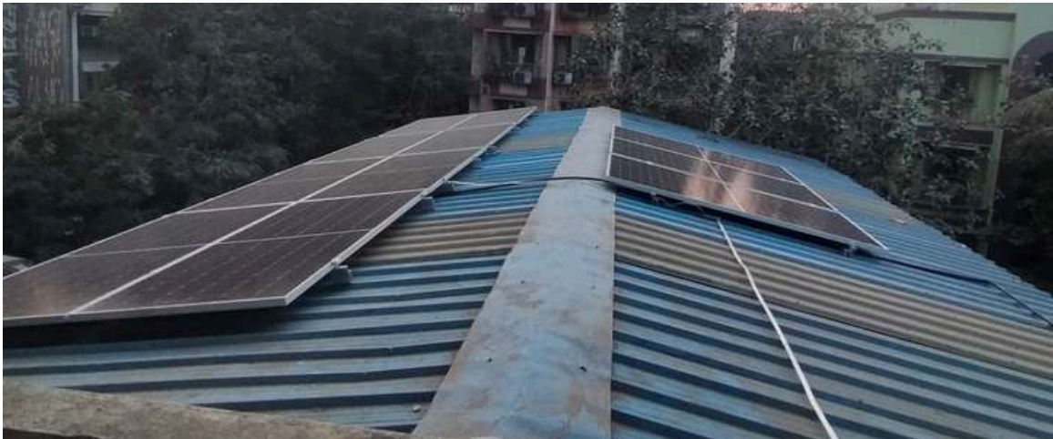
KALYAN DOMBIVALI MUNICIPAL CORP. (30KW)