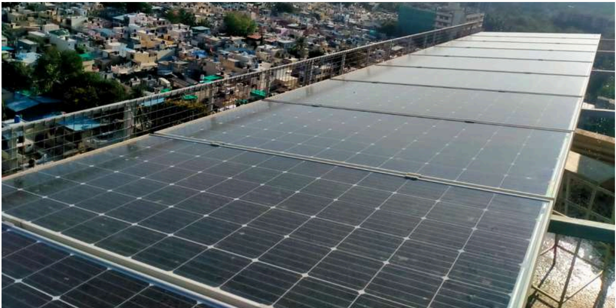
JIN PREM CHS (35KW)