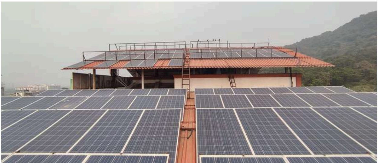
DELHI DARBAR INN (150KW)