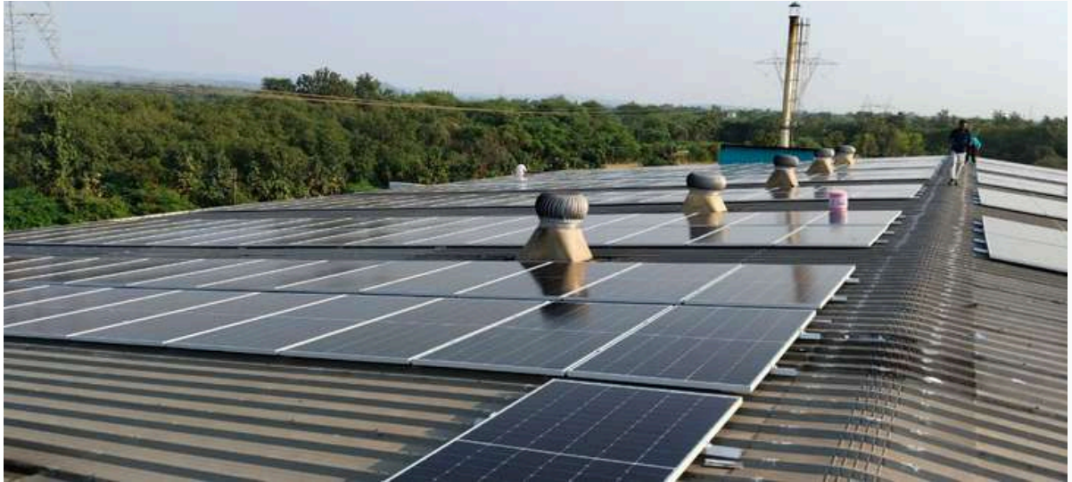
BHANSALI PACKING SERVICE (200KW)