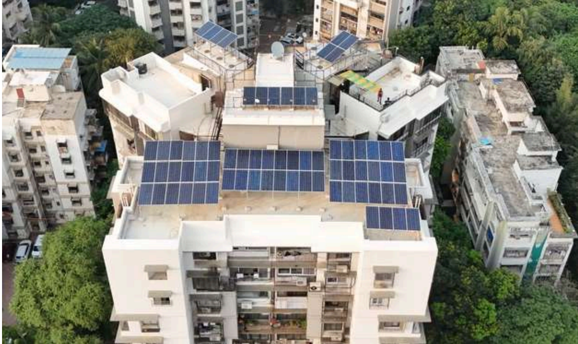
RAGHUNATH TOWER (25KW)